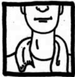
Scarfs or Parkas