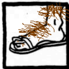
Bilbo Baggins Foot Hair Wear