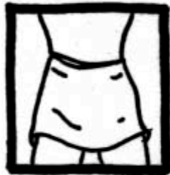
No shorts with writing on the butt or volleyball shorts really short skirts or Shorts, 4" Inseam