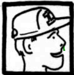
Hangers (Mucus Pickus Snackum)